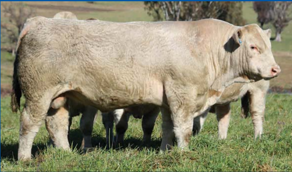
LOT 2 Wakefield Rockabilly (P) BIS R319E