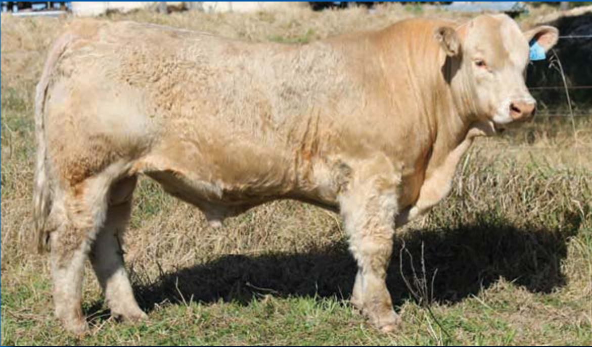
LOT 1 Wakefield Strike Me Lucky (P) BIS S1E