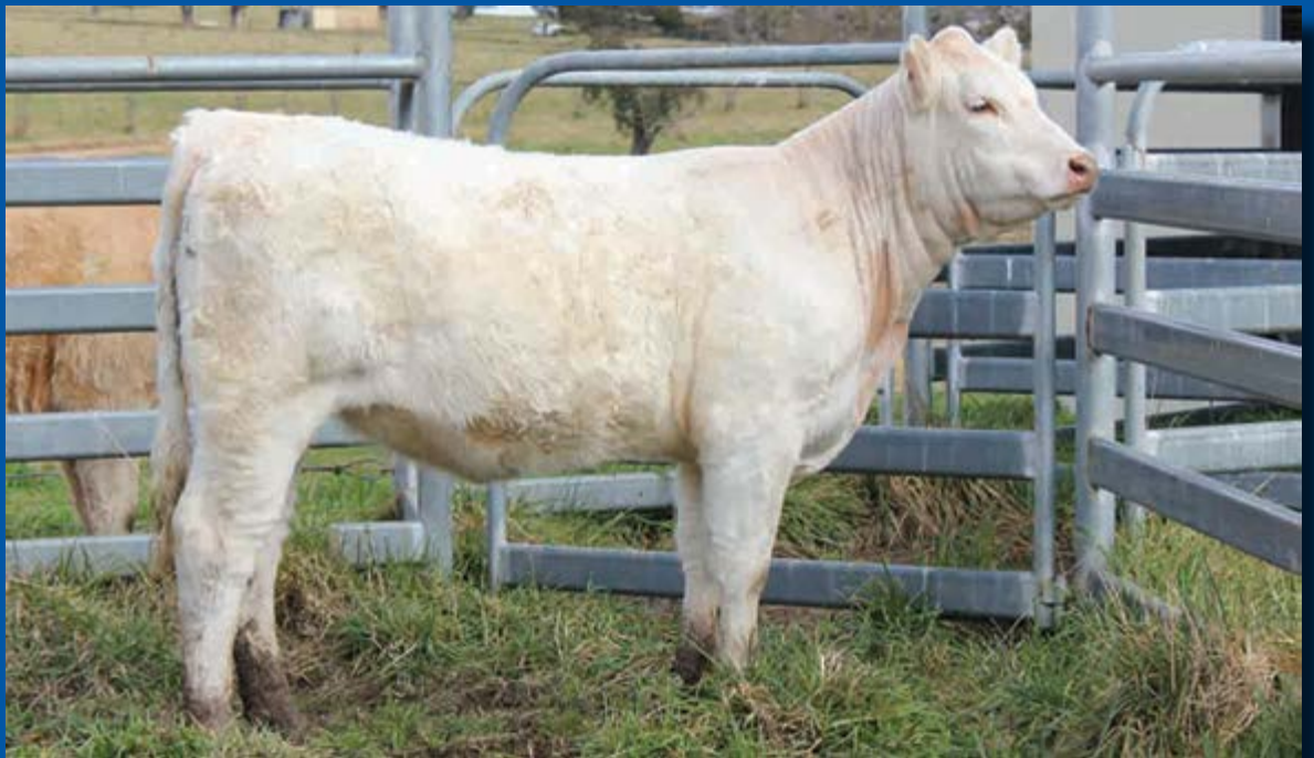
LOT 88 Wakefield Alanna 89 BISS22E