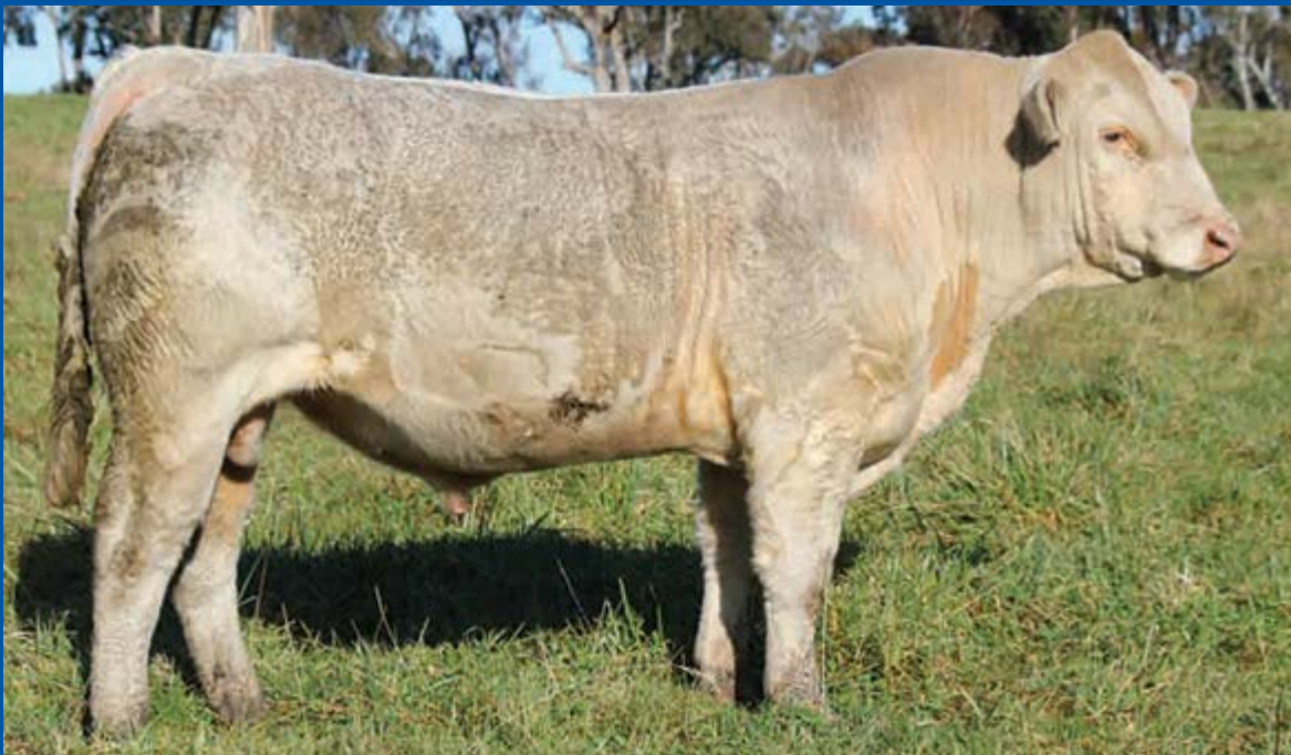
LOT 15 Wakefield Roll The Dice (P) BIS R355E