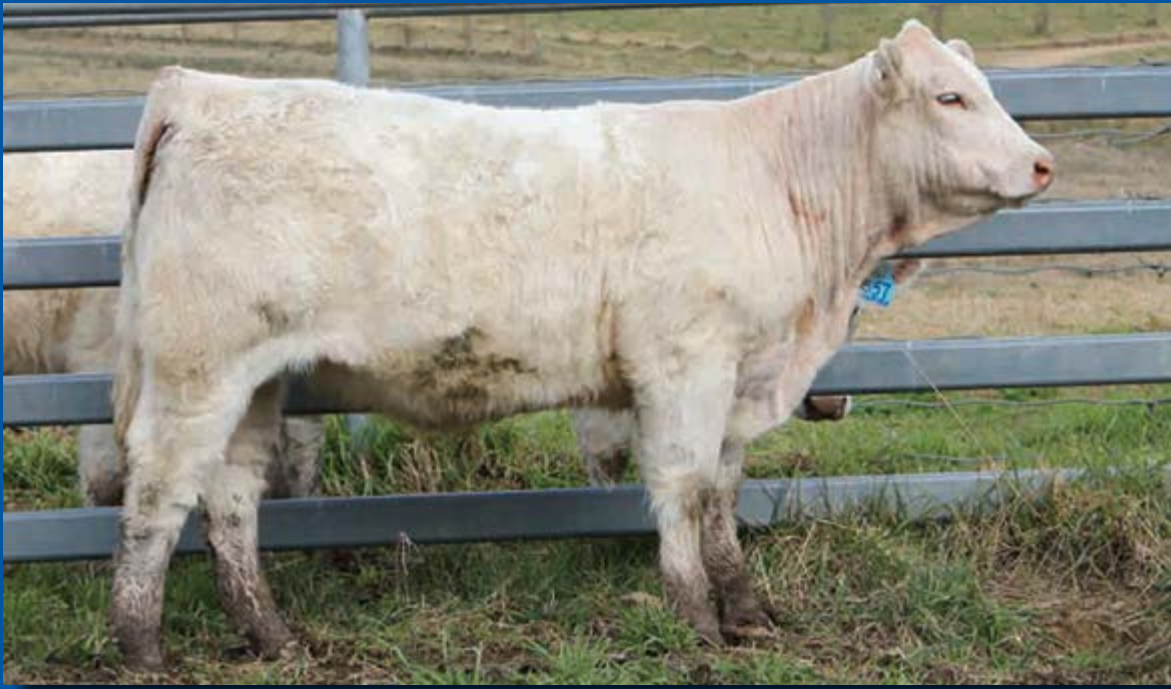
LOT 83 Wakefield Ascot 59 BISS85E