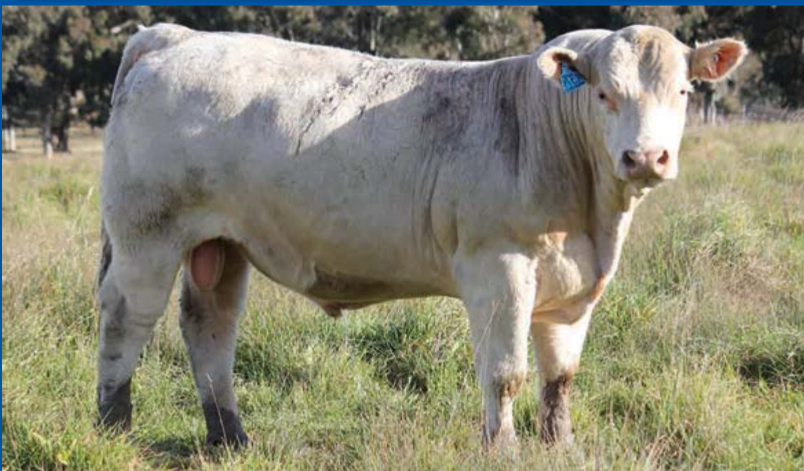
LOT 16 Wakefield Razors Edge (P) BIS R379E