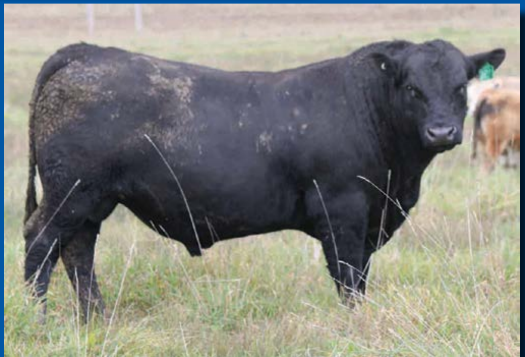
LOT 55 Wakefield Niagara ANNR522

17TH ANNUAL CHAROLAIS & ANGUS BULL SALE Friday 12th August 2022 at 1pm at "Wakefield", Wollomombi, NSW