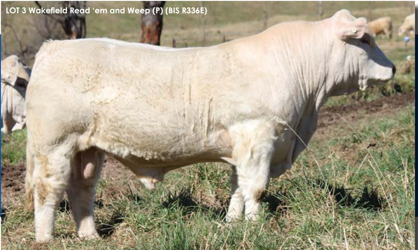
LOT 3 Wakefield Read 'em and Weep (P) (BIS R336E)

Friday 12th August 2022 at 1pm "Wakefield", Wollomombi, NSW