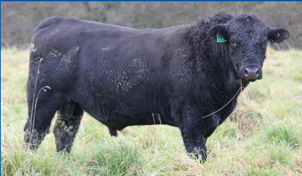
LOT 65 Wakefield Keystone ANNR480