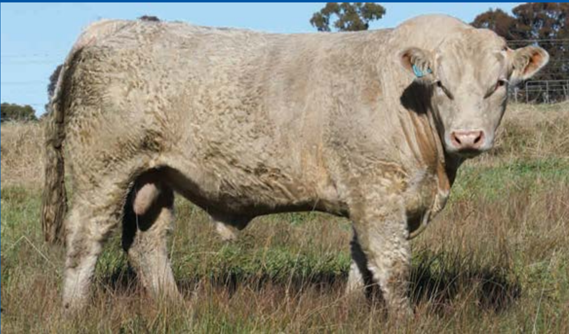
LOT 23 Wakefield Rackateer BIS R300E