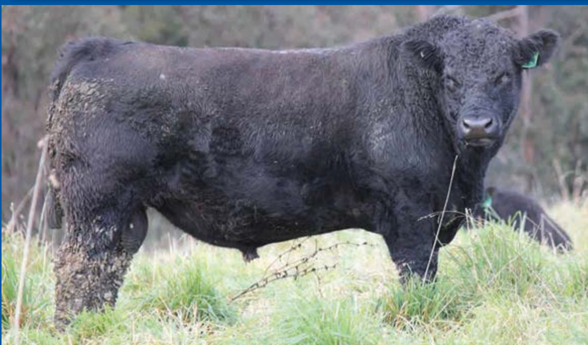
LOT 67 Wakefield Command ANNR502