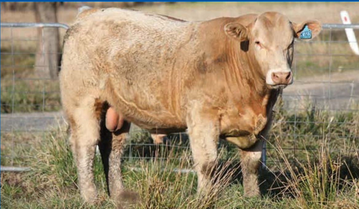
LOT 26 Wakefield Rookie (P/S) BIS R723E