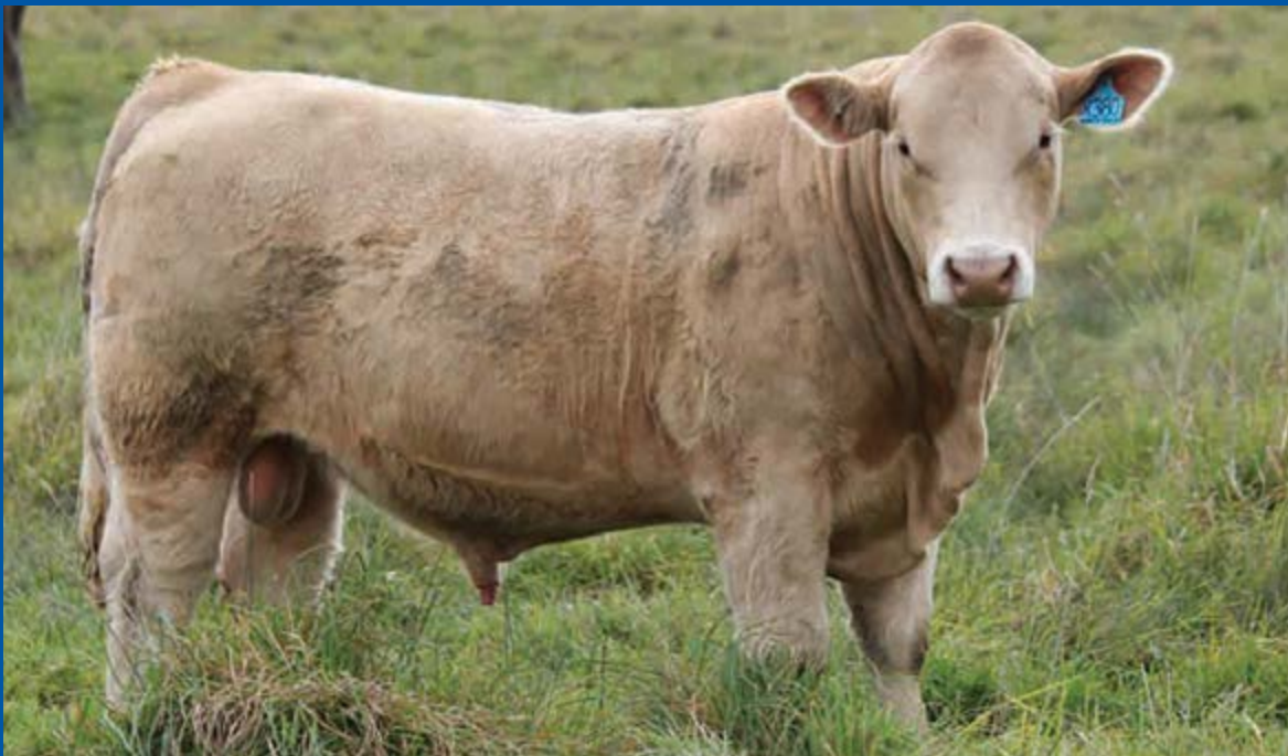
LOT 14 Wakefield Rolled Gold (P) BIS R380E