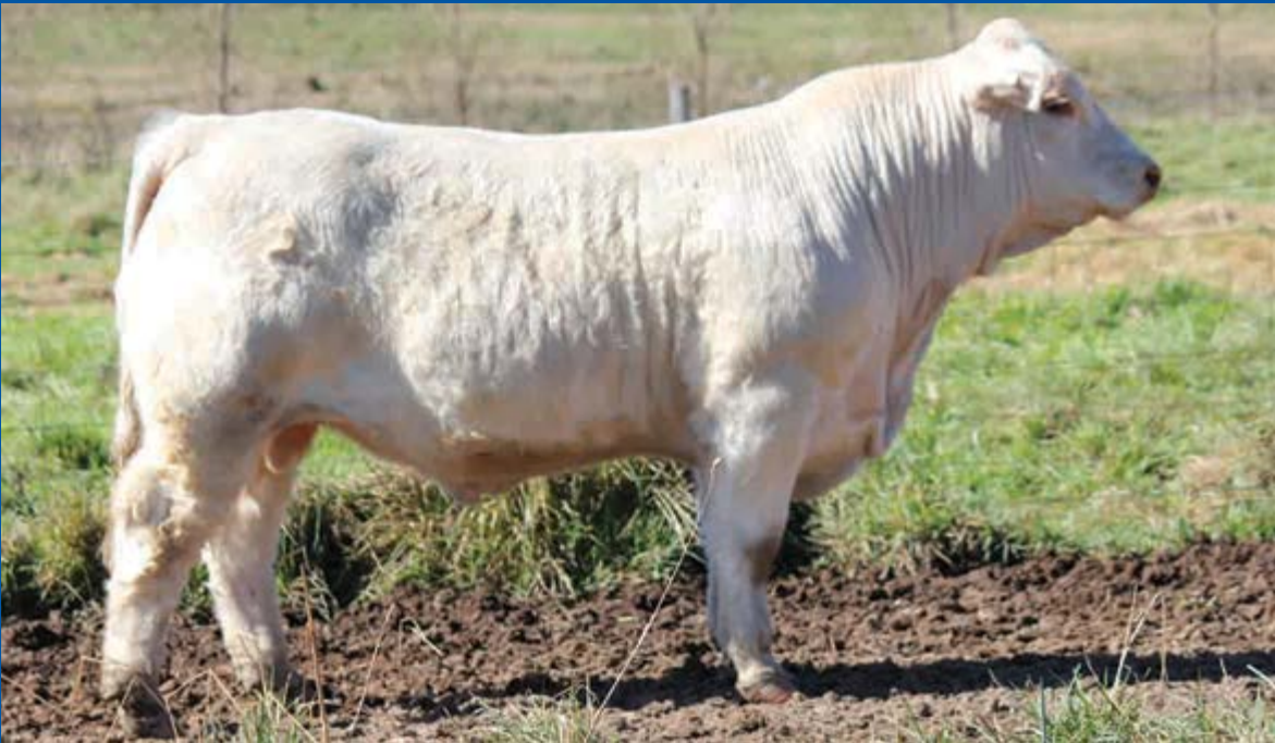
LOT 5 Wakefield Swashbuckler (P) BIS S7E