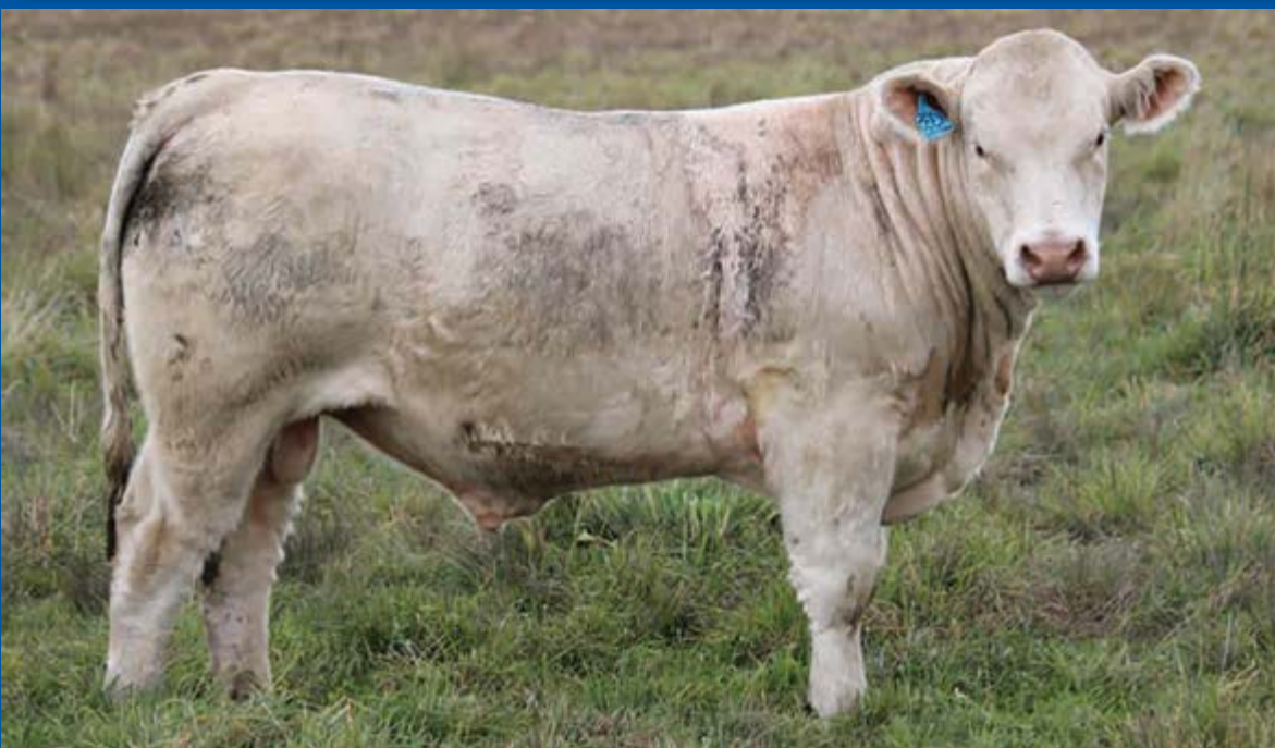
LOT 10 Wakefield Ricciardo BIS R335E