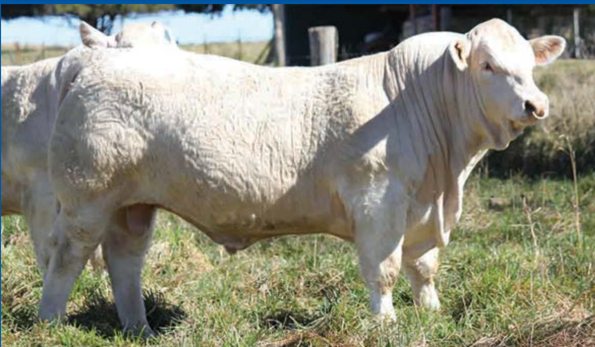
LOT 4 Wakefield Raise The Bar (P) BIS R328E