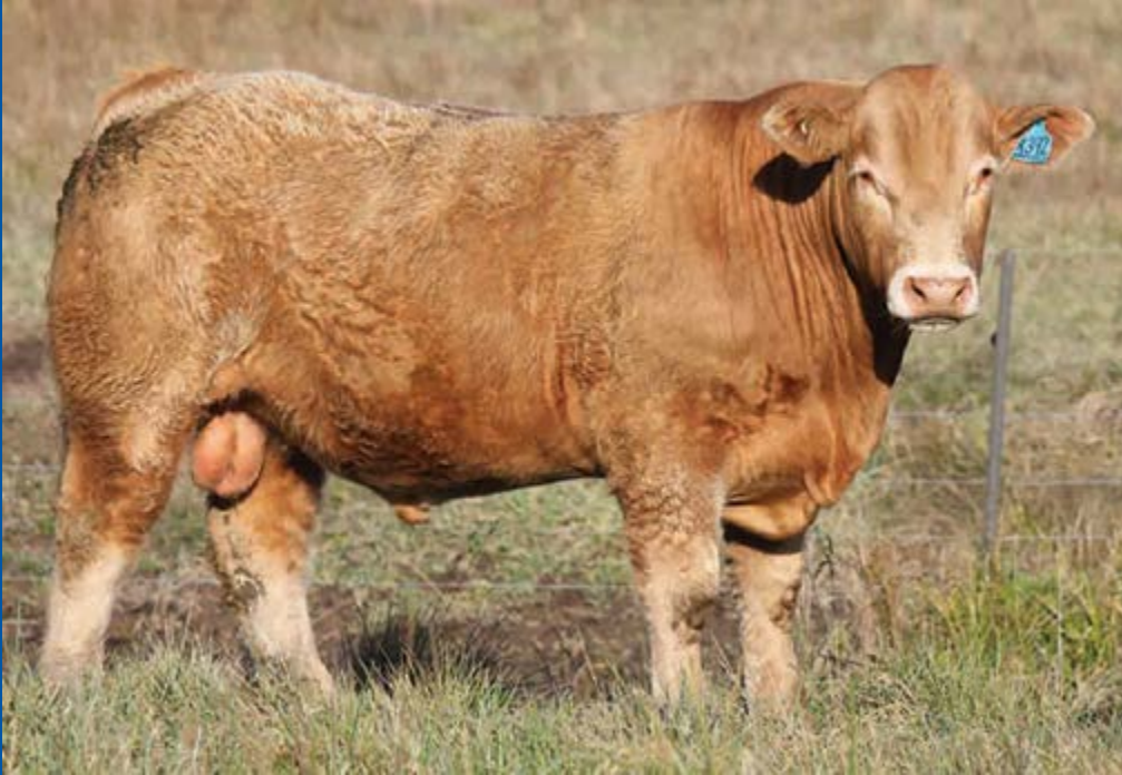
LOT 7 Wakefield Red Hot (P) BIS R392E