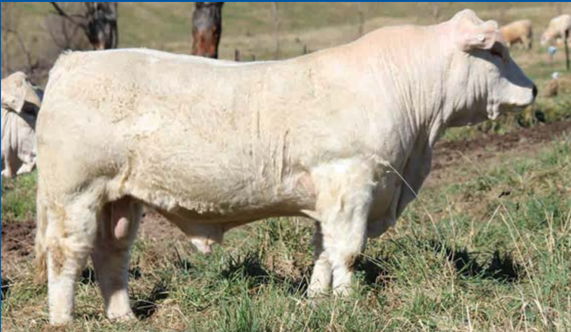
LOT 3 Wakefield Reed 'em and Weep (P) BIS R336E