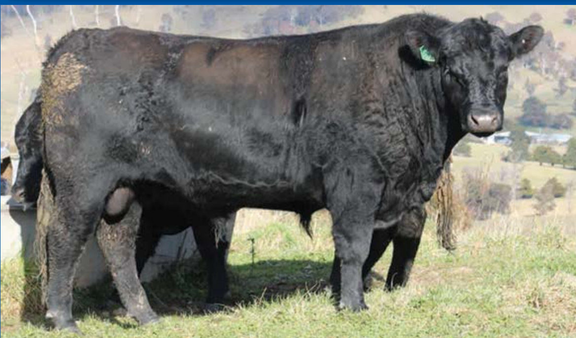
LOT 52 Wakefield Primequarter ANN R460