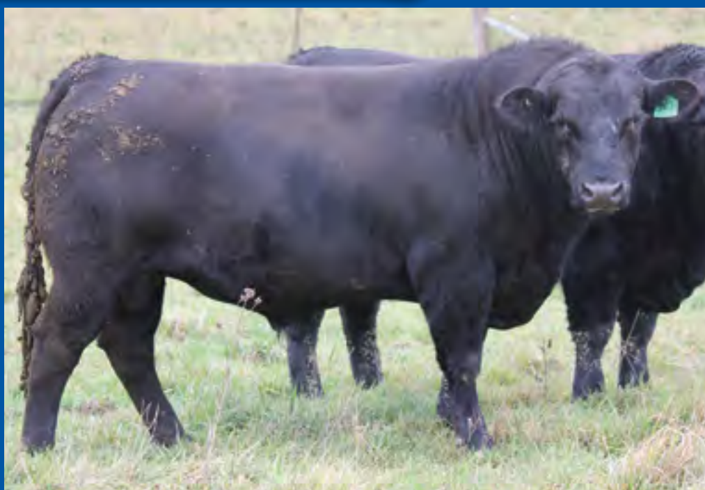
LOT 48 Wakefield Kaiser ANNQ408