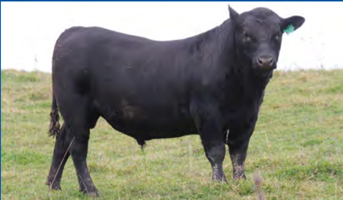
LOT 43 Wakefield Kodak ANNQ419