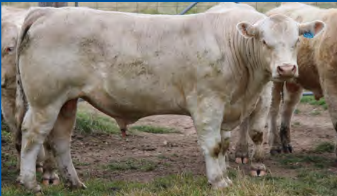
LOT 9 Wakefield Quarry (P) BIS Q260E