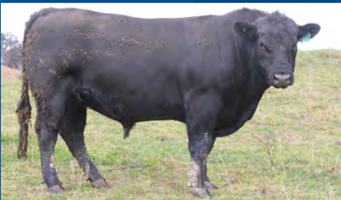
LOT 46 Wakefield Visionary ANNQ404