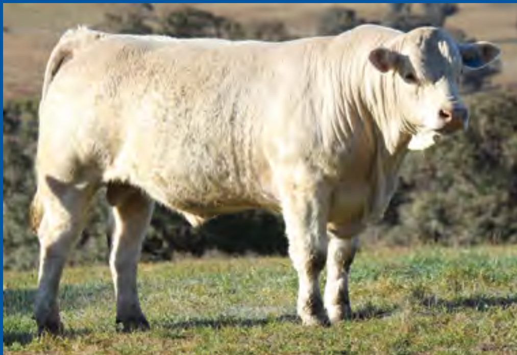
LOT 30 Wakefield Quantum (P) BIS Q210E