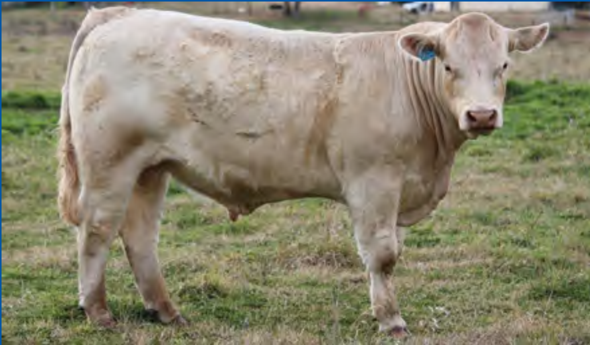
LOT 38 Wakefield Record Time (P) BIS Q283A