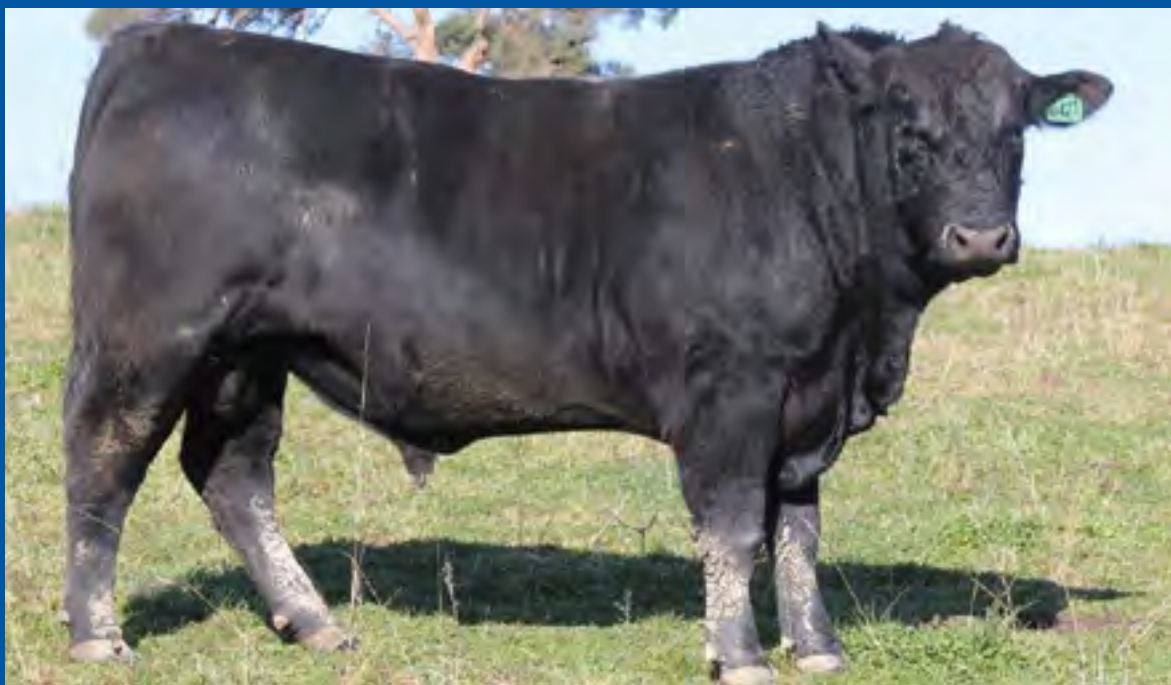
LOT 49 Wakefield Legend ANNQ421