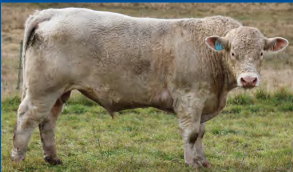
LOT 3 Wakefield QC (P) BIS Q177E