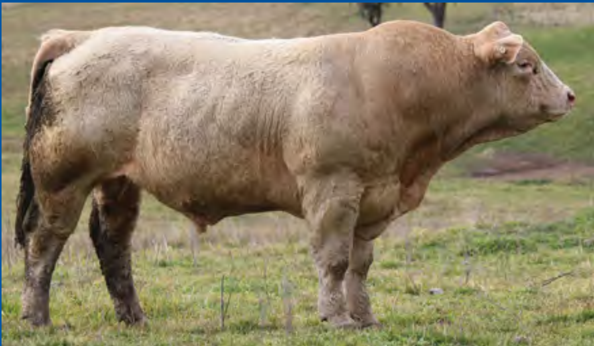
LOT 2 Wakefield Quimby (P) BIS Q183E