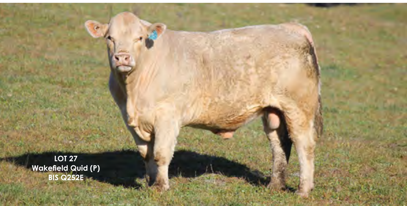
LOT 27 Wakefield Quid (P) BIS Q252E

Friday 13th August 2021 at 1pm “Wakefield”, Wollomombi, NSW