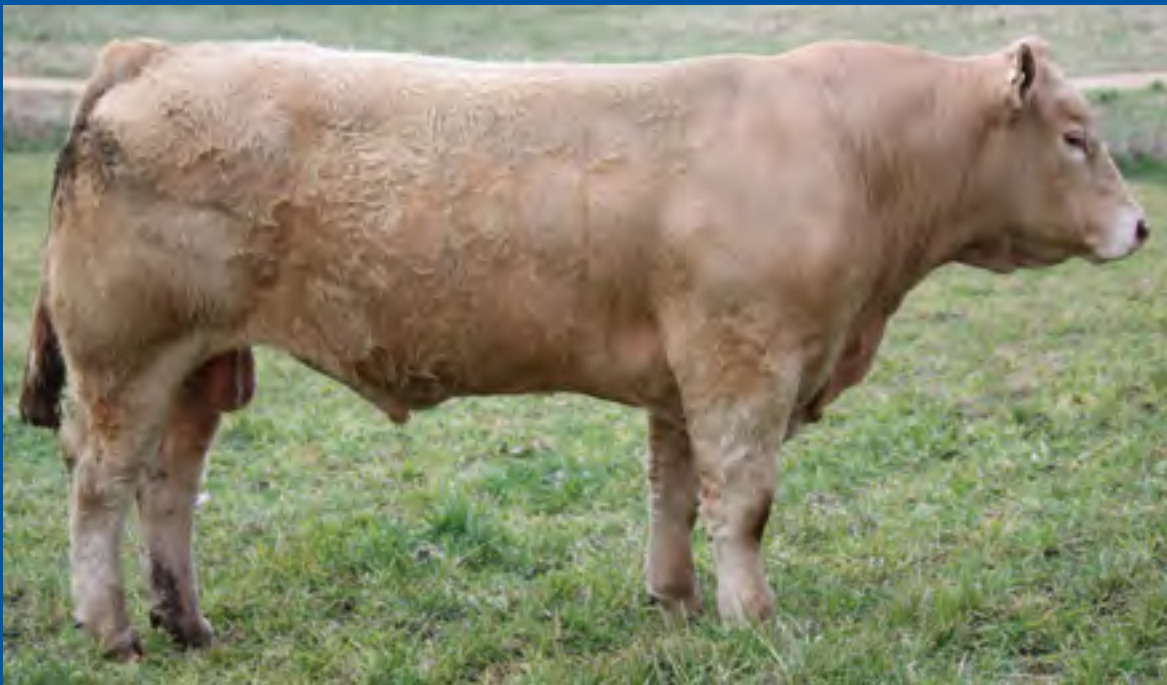
LOT 1 Wakefield Quantum Leap (P) BIS Q237E