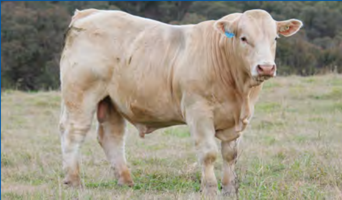
LOT 5 Wakefield Right On Time (P) BIS R287A