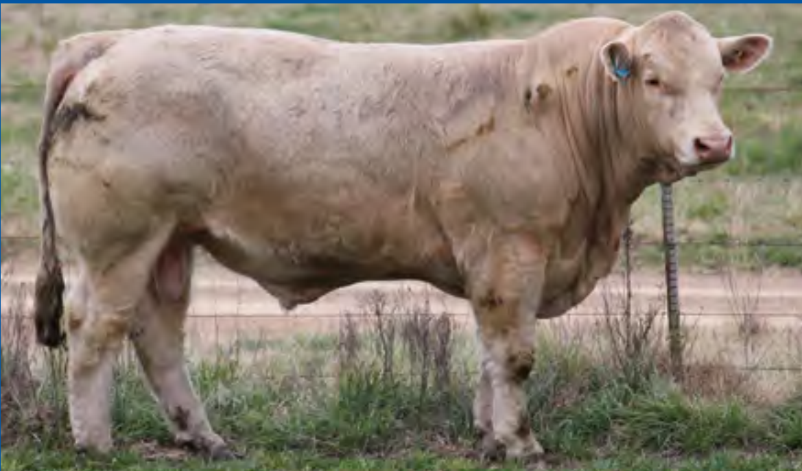
LOT 10 Wakefield Quest From The West (P) BIS Q249E