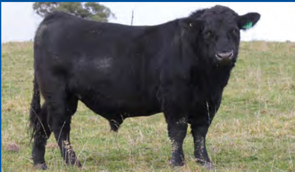
LOT 50 Wakefield Niagara ANNQ441