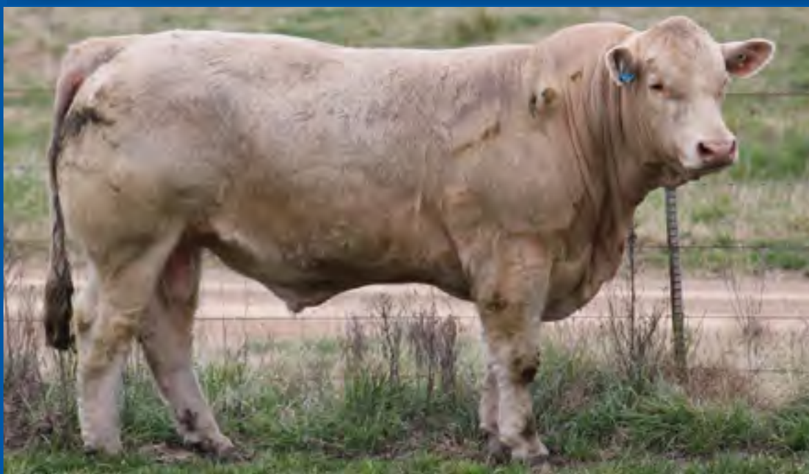
LOT 10 Wakefield Quest From The West (P) BIS Q249E