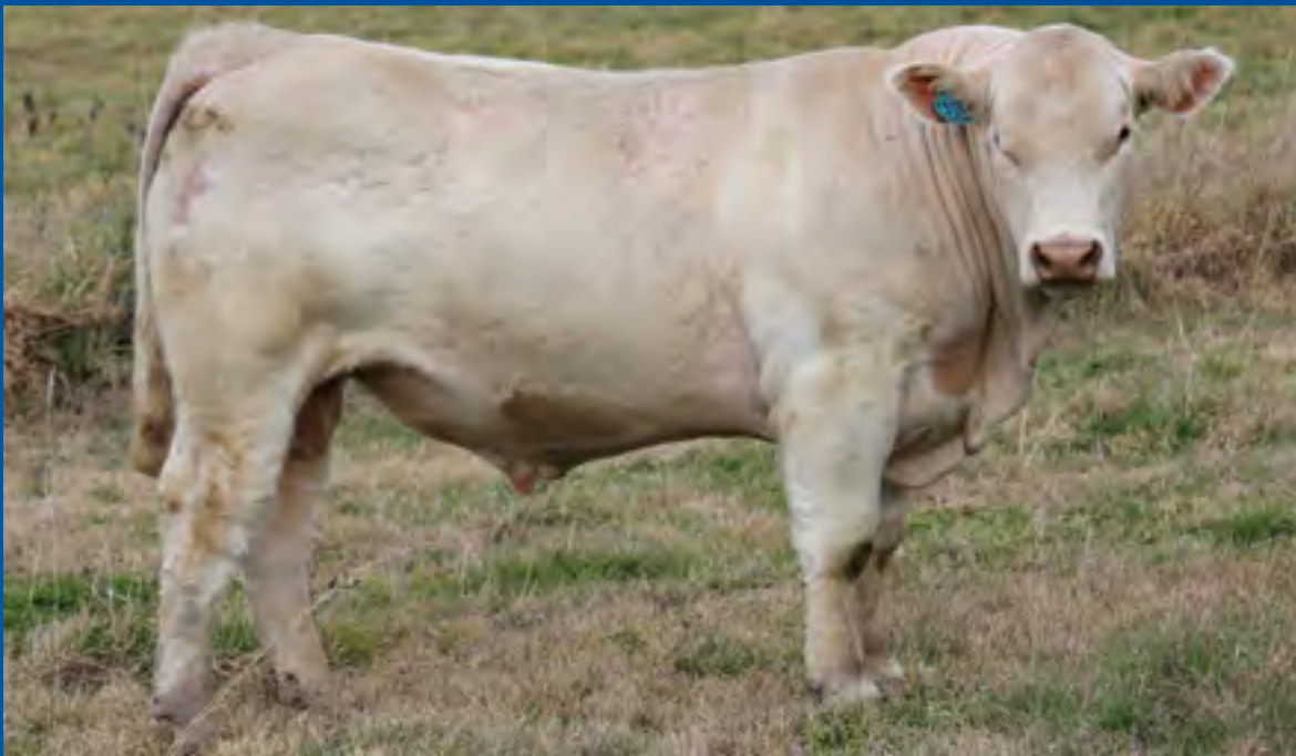
LOT 6 Wakefield Quality Assured (P) BIS Q241E