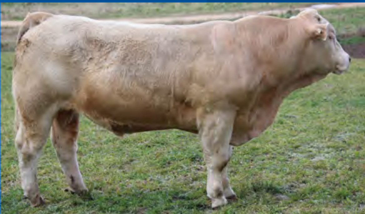
LOT 26 Wakefield Quadratic (P/S) BIS Q234E