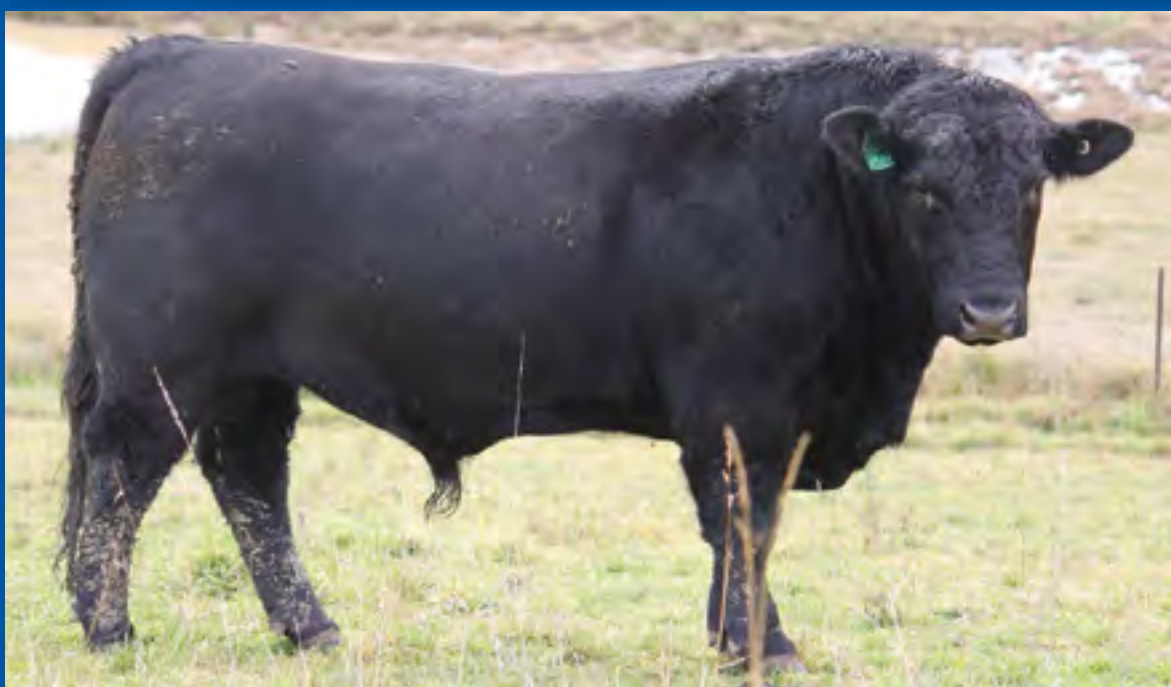
LOT 58 Wakefield Legend ANNQ443