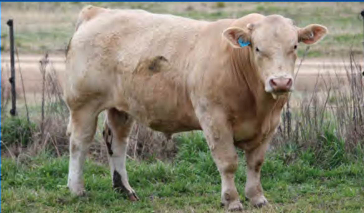
LOT 25 Wakefield Quilpy (P/S) BIS Q245E