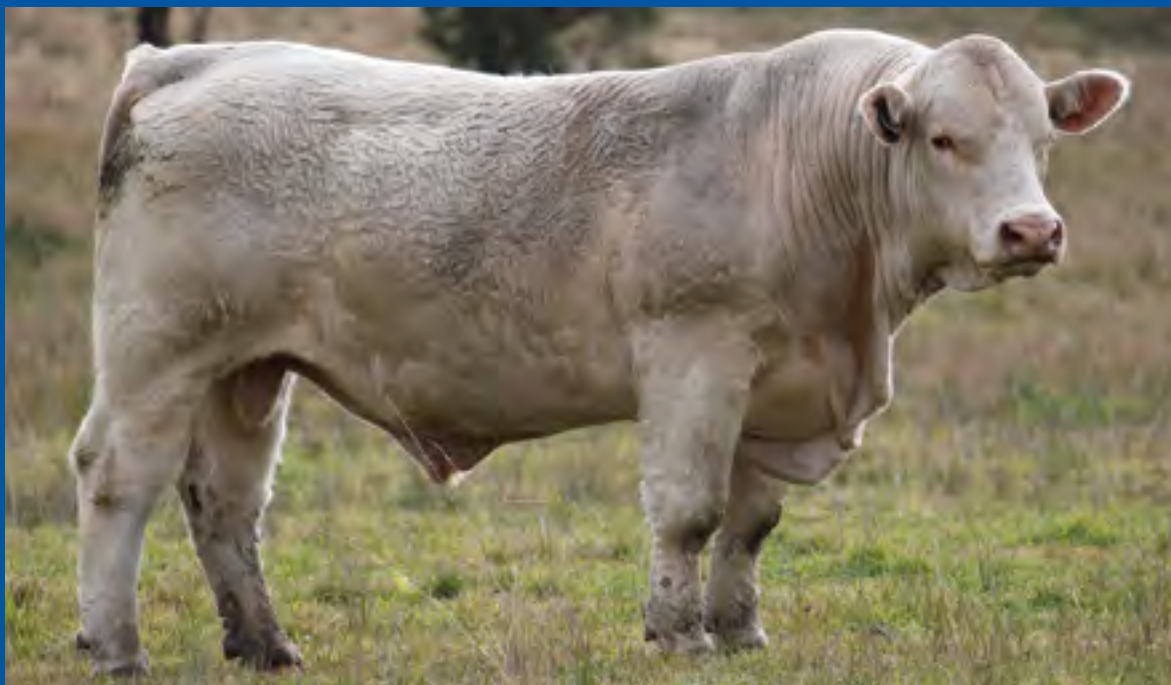
LOT 4 Wakefield Quickstep (P) BIS Q178E