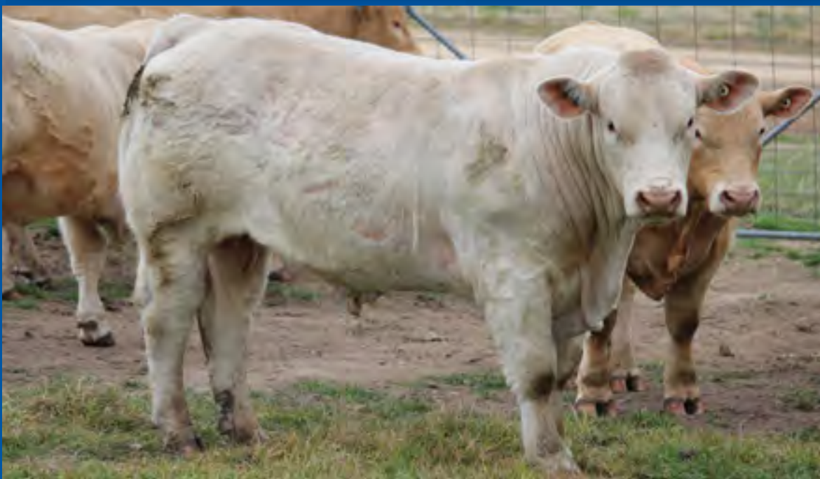
LOT 7 Wakefield Quizzical BIS Q216E